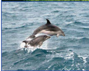
These dolphins will be your travelling companions during your passages...

anchorage which deserve to be visited in good weather. Horseshoe Bay, situated on the east coast of Big Cavalli is quite busy, as are the footpaths which circle the island and offer an amazing view of the waters bordering the island. This