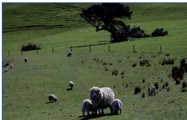
The sheep, symbol of the country, is present everywhere.