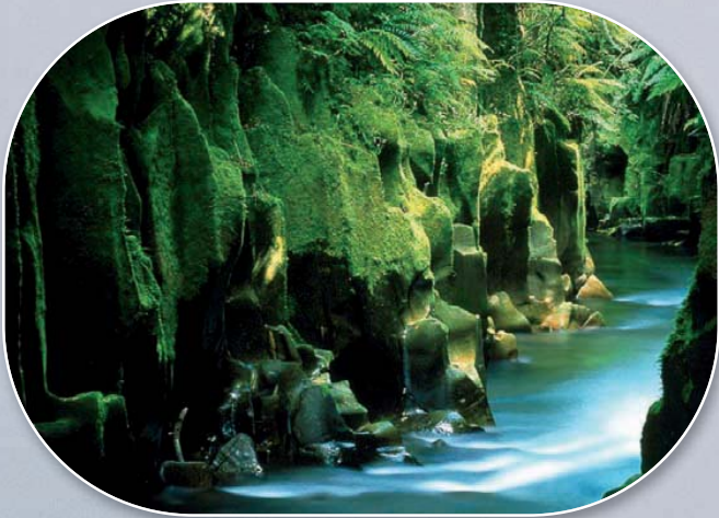
A magical atmosphere; welcome to New Zealand!

Aboard this Leopard 46, you will enjoy the delightful and often deserted anchorages in the Bay of Islands.