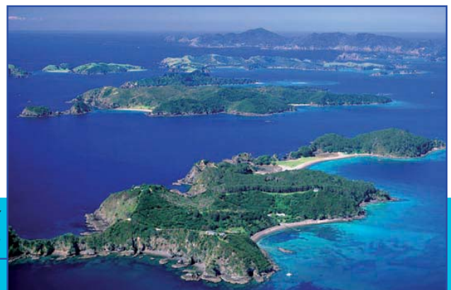
A jagged coastline, a symphony of colours and anchorages galore: this is the Bay of Islands!

Cruising in New Zealand means being lucky enough to discover a country of sailors who are passionate about multihulls, as well as, and above all, some incredibly preserved, imposing scenery... A must!