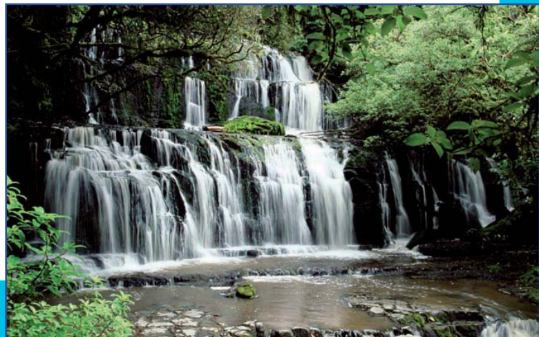
Nature is particularly preserved: you must get off the beaten tracks and away from the sea shore...