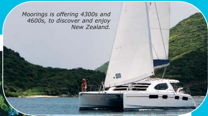
Moorings is offering 4300s and 4600s, to discover and enjoy New Zealand.